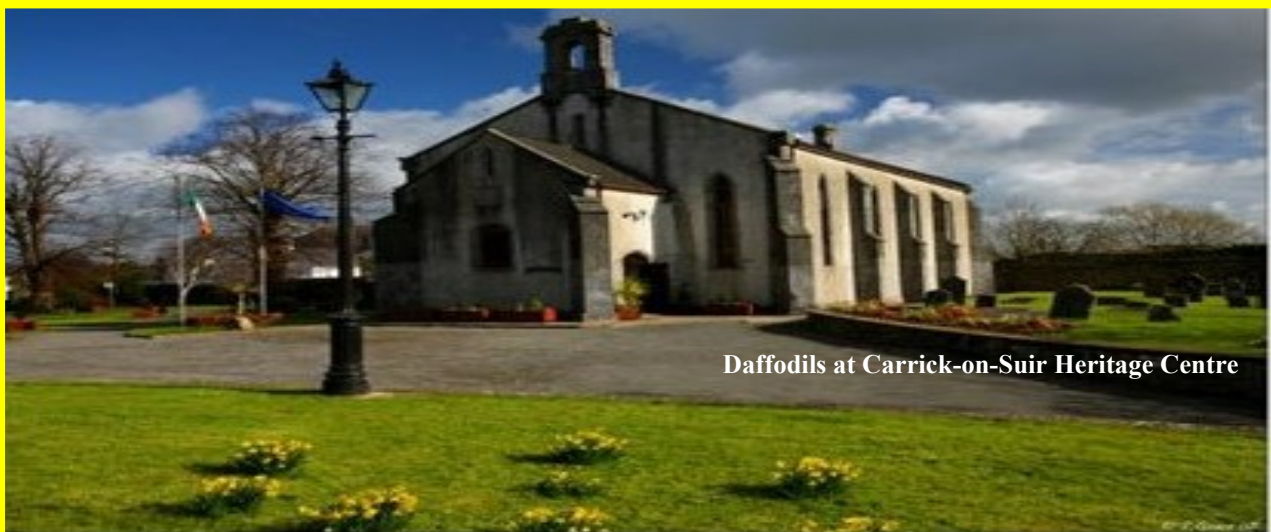
Daffodils at Carrick-on-Suir Heritage Centre

If you would like to provide content to the next issue of this newsletter or add your organisation as a group that receives this on a mailing list please email: