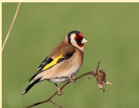
Goldfinch on Knapweed

Follow us on Facebook and Instagram: Tipperary Heritage Office.