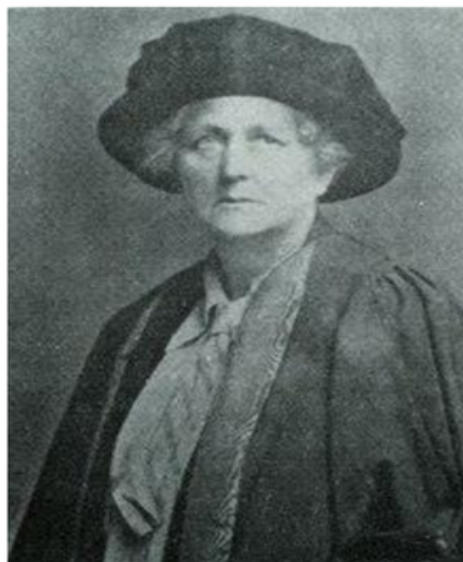
Aleen Cust 1868-1937