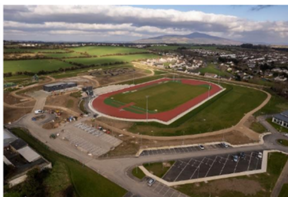
Clonmel Regional Sports Hub