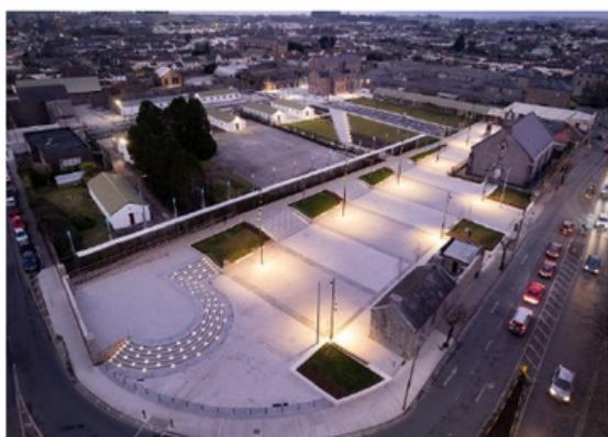
Kickham Barracks Plaza

Clonmel 2030 - Transformational Regeneration: -seeks to develop a multi-dimensional, public/private/community partnership proposal for Clonmel, which will re-imagine how civic, cultural, educational, enterprise and tourism uses can work together to regenerate and create a new role for the town. The project includes four intrinsically linked and integrated pillars, namely: Kickham Barracks Regeneration, Clonmel Regional Sports Hub, Clonmel – Flights of Discovery and Clonmel Public Realm Enhancement. Funding was received for proposed Category A works in 2019 relating to Kickham Barracks Regeneration Phase 1 and Clonmel Regional Sports Hub. Both elements of the project are completed. Total project costs approved are €15,163,247 and URDF grant awarded is €10,594,961.