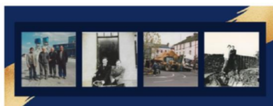
A photographic collection by Ed 'Ned' O'Shea Step back in time in Thurles through the lens of talented local photographer Ed 'Ned' O'Shea. With a passion for capturing the essence of this charming Irish town, Ned's photographic collection is a true visual treat. From the streets to the people, Ned's keen eye for detail and personality is evident. There are photographs documenting the demolition of the Market House and Turkulla