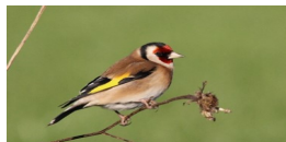
Goldfinch on Knapweed

If you would like to be part of our mailing list please send an email with "Subscribe" in the subject line to: heritage@tipperarycoco.ie Follow us on Facebook and Instagram: Tipperary Heritage Office.