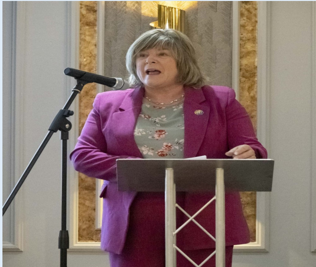
Minister for State at the Department of Health, Mary Butler, T.D., addressing the 2nd Regional Stroke Conference at the Talbot Hotel, Clonmel, on 26th June