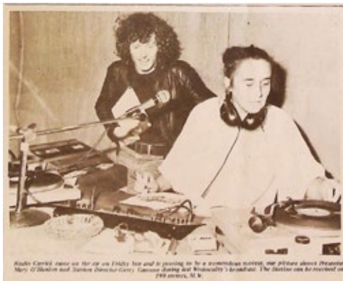
Newspaper coverage of the launch of Radio Carrick in 1980

Reimagining the birth and broadcast of 'Radio Carrick' amidst the pulse of 1980s life.