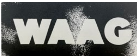
Image: invite to the exhibition WAAG - Art Beyond Barriers in 1989