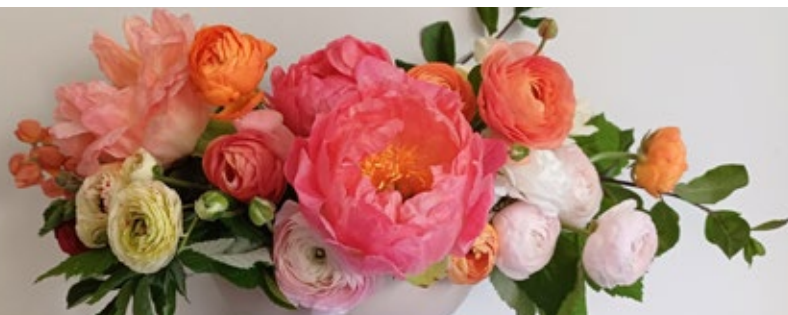
Hand-tied bouquet with Roisin O'Connell